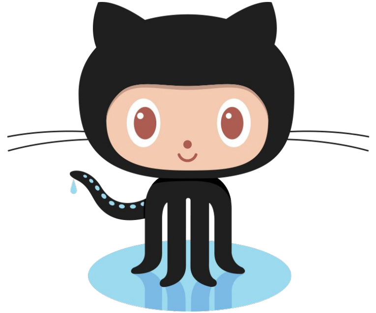
Octocat, Mascot of Github